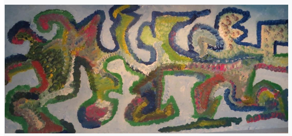
Voices in my back

"Art opens your eyes to three very important realities. Even if you only see one of the three, it can already make you a much happier person. The three of them form an extremely intoxicating happiness cocktail. Being: